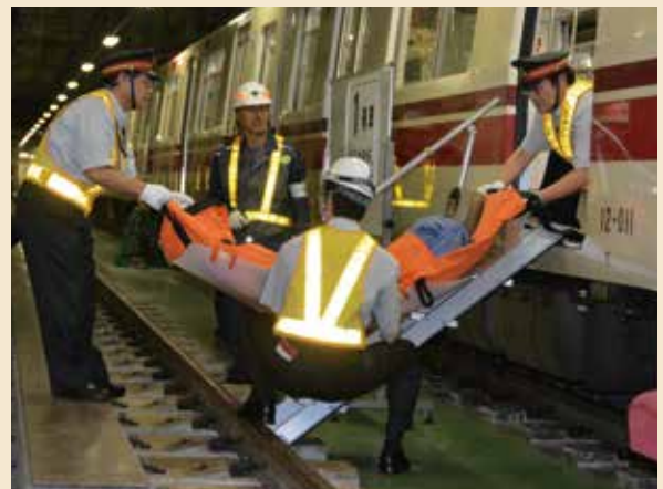
General Drills in case of Abnormal Occurrences