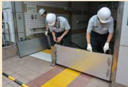
Drills in Case of Natural Disasters