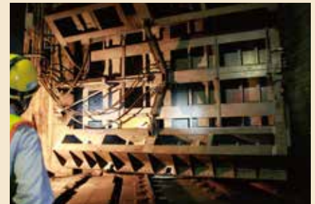
Watertight doors (in tunnels)