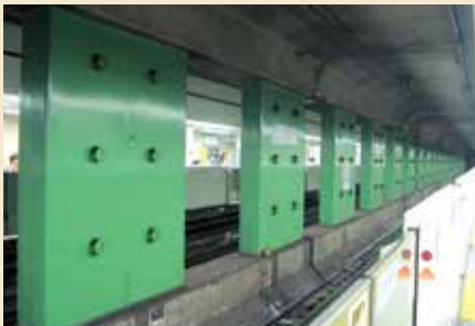
Reinforcement of the central pillars of the platform